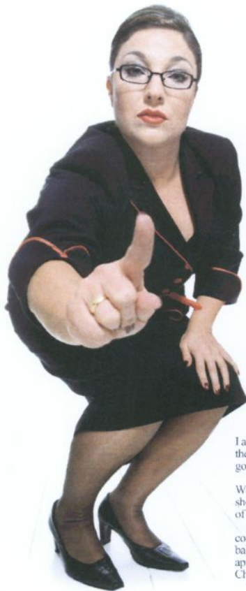
What nanny would suit you best - the stern Supernanny Jo Frost (above) or the fun-loving Fran Drescher (in The Nanny far right)?